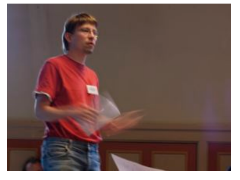
2020 Vision: Council's proposed vision was carried with a few amendments.

Sustainability policy: The assembly voted to approve a new sustainability policy for EUDEC.