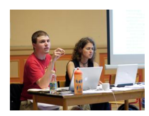
A Fair Pay Policy was adopted.

The assembly voted to form a membership committee to review EUDEC's membership system.